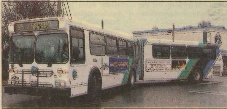
The old Everett Transit colors make it hard to distinguish ET buses from Community Transit and Sound Transit buses.

Everett Transit's new bus color scheme is easier for riders to distinguish, and it's also cheaper to apply than the old colors.